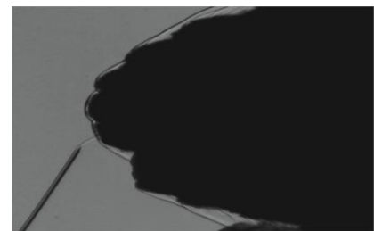
Figure 3. High-speed camera shadowgram